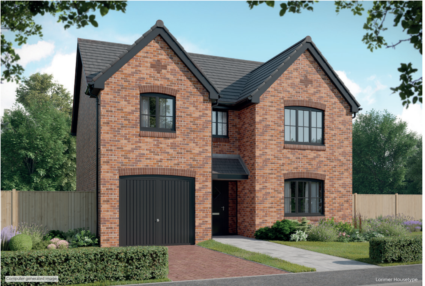
Computer generated image.