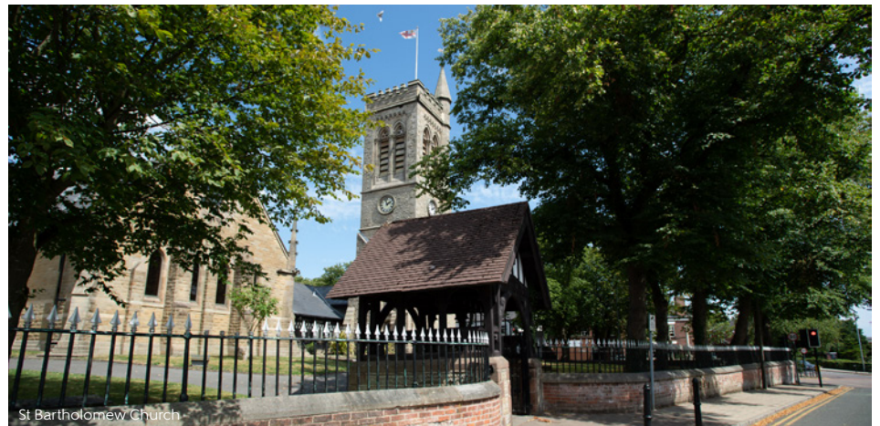
St Bartholomew Church