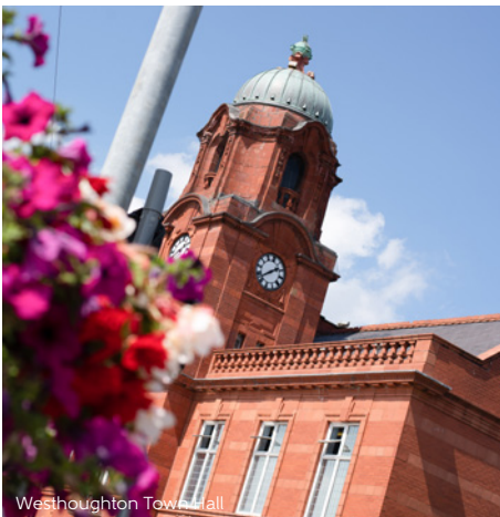
Westhoughton Town Hall

Built across a variety of styles to the exacting Bellway standard, these homes present a range of design features compatible with modern lifestyles including open-plan living spaces, contemporary fitted kitchens and en-suite bathrooms in addition to either garages or allocated parking to each property.