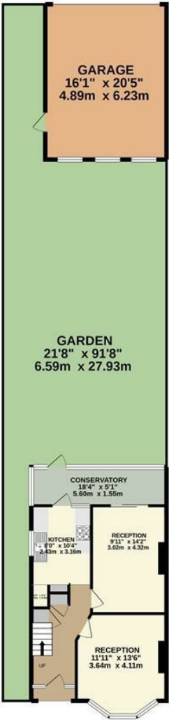
GROUND FLOOR 883 sq.ft. (82.1 sq.m.) approx.