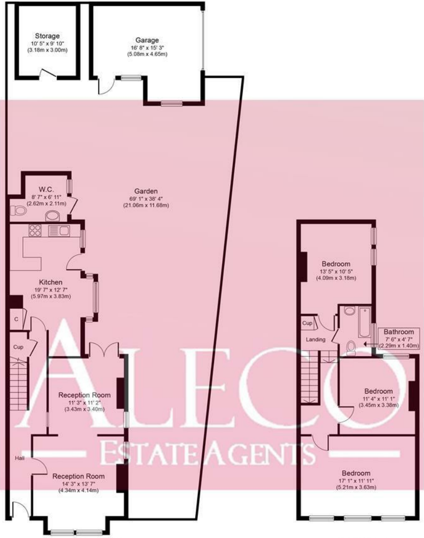
Ground Floor Approximate Floor Area 987 sq. ft. (91.7 sq. m.)