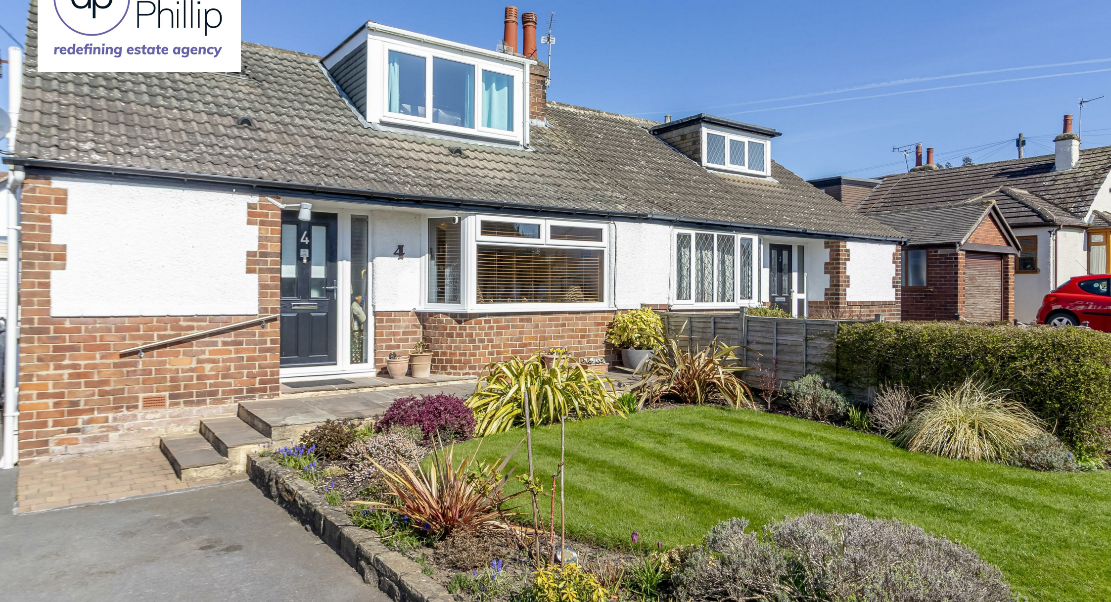
4 The Cedars, Leeds, LS16 9EA Price Guide £375,000