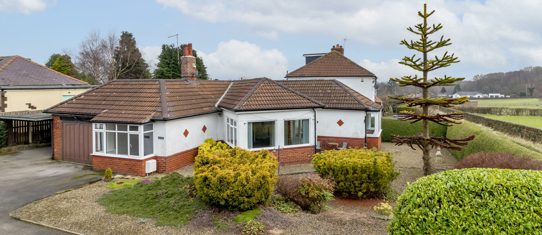
The Haven Quarry Farm Road, Pool in Wharfedale, LS21 3BT Offers Over £400,000