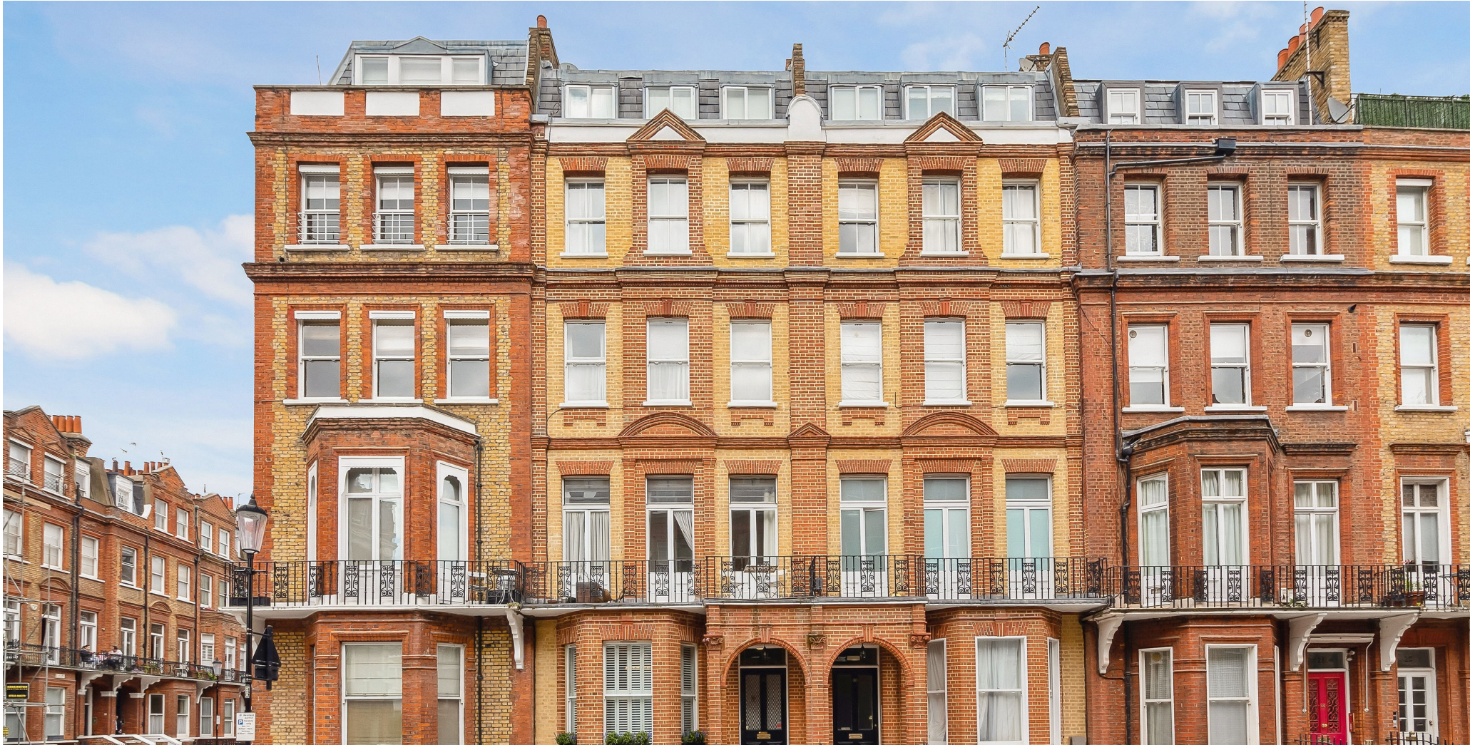
BRECHIN PLACE, South Kensington SW7