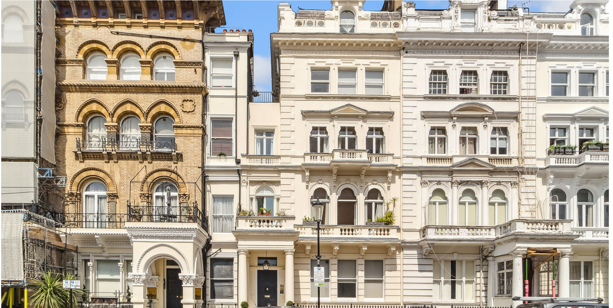
QUEENS GATE TERRACE, South Kensington SW7