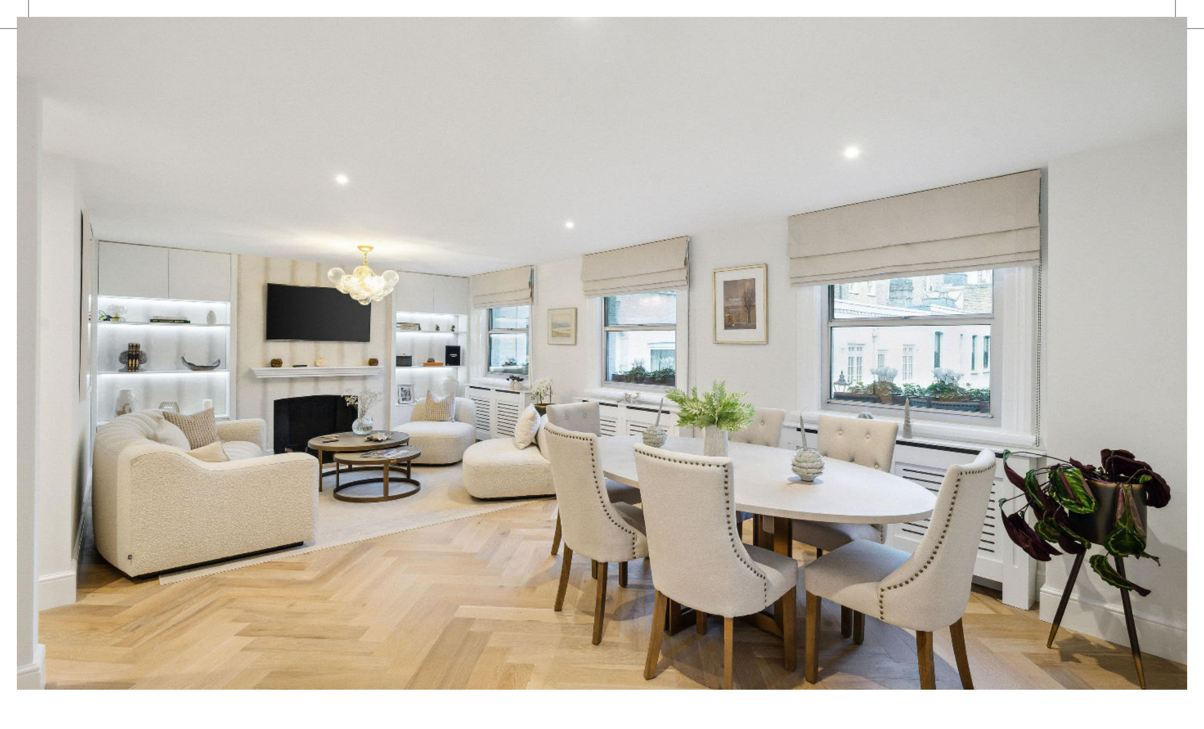
Gaspar Mews, London, SW5