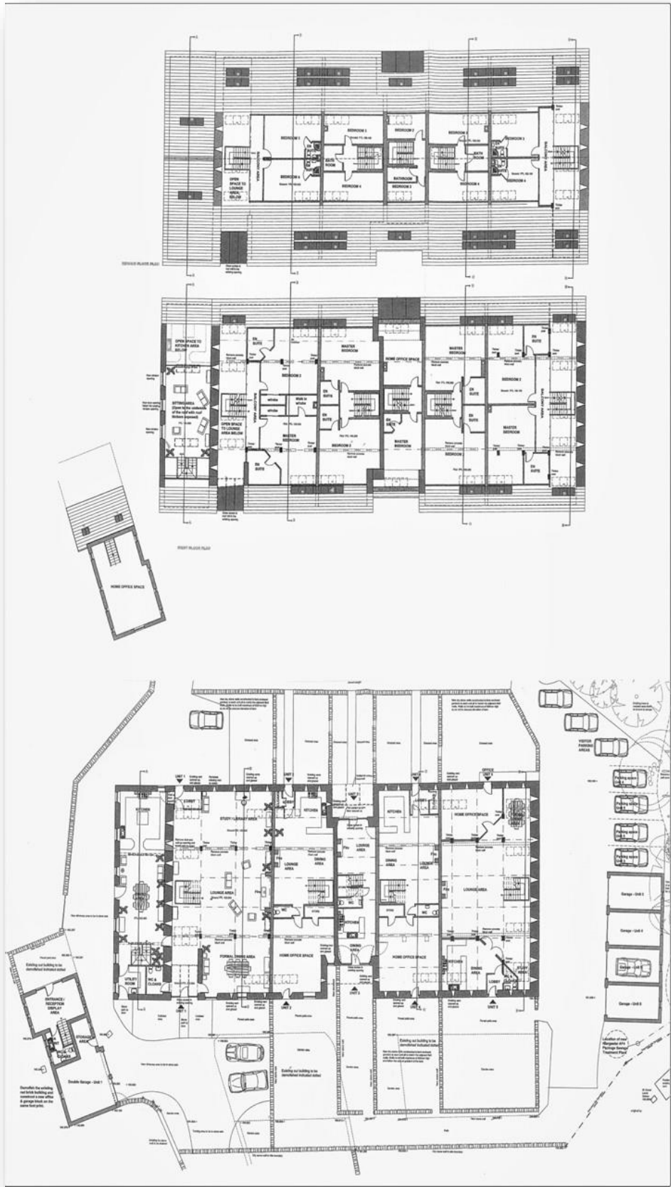
Layout from application 72/2015/15718