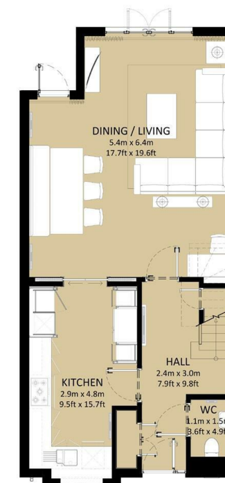
GROUND FLOOR PLAN 60m 2 / 645ft 2