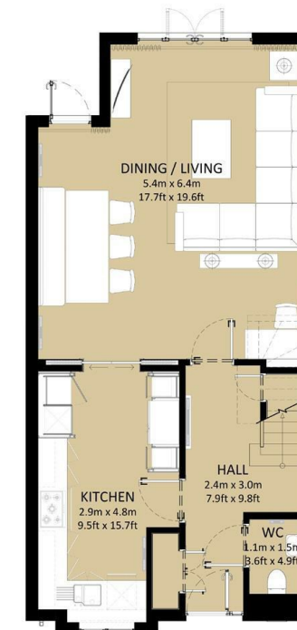
GROUND FLOOR PLAN 60m 2 / 645ft 2