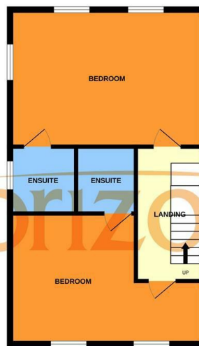
1ST FLOOR 553 sq.ft. (51.4 sq.m.) approx.