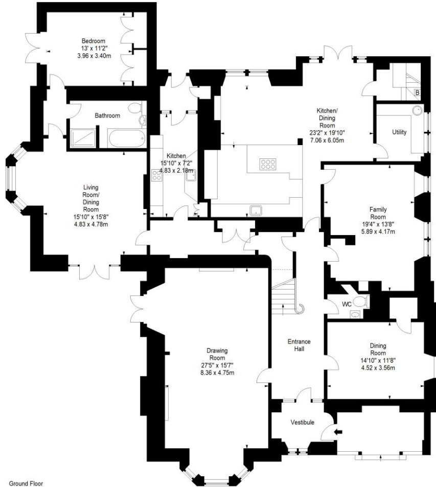
Basement Ground Floor