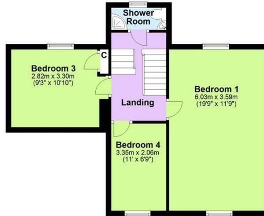
First Floor Approx. 51.5 sq. metres (554.4 sq. feet)