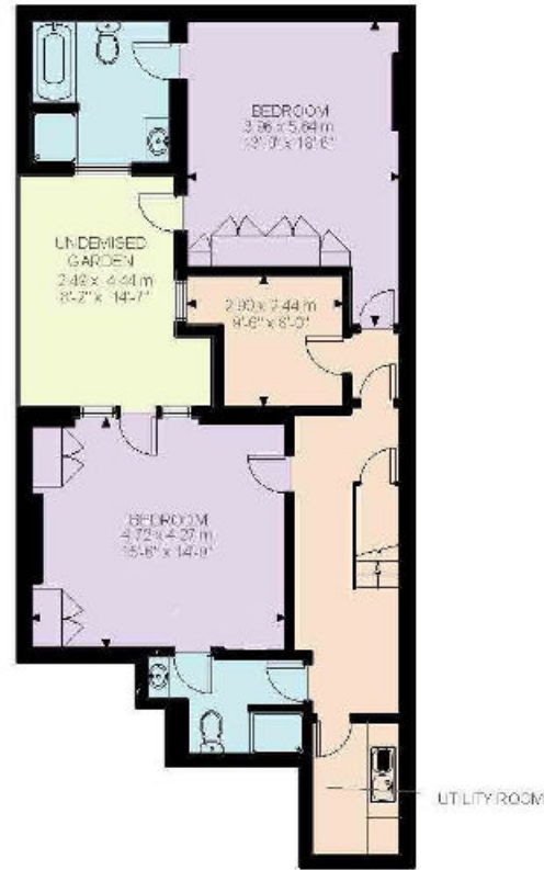
Lower Ground Floor 825 ft 2

This plan is for guidance only and must not be relied upon as a statement of fact. Attention is drawn to the important notice on the last page of the text of the Particulars.