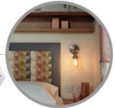
Stylish light fittings with low energy bulbs