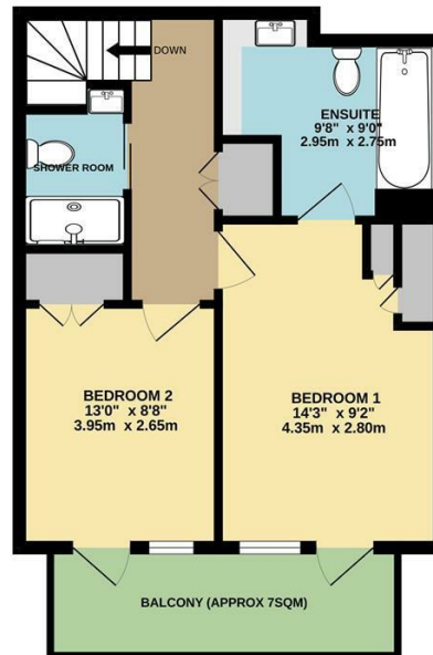
1ST FLOOR 419 sq.ft. (38.9 sq.m.) approx.