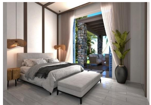
Finished Example of a similar property on the developer's sister project: