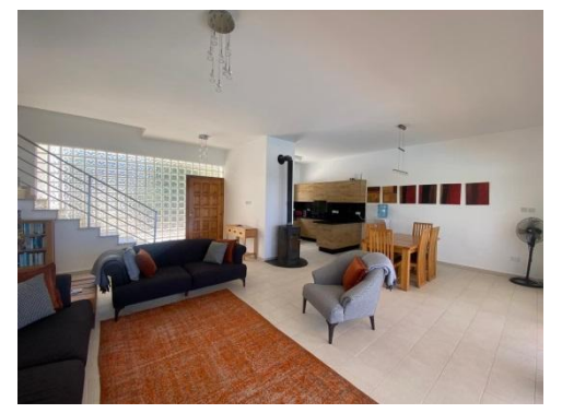
Page 2 of 6