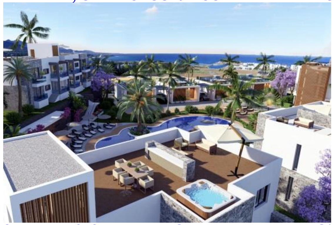
£249,950 & £274,950 - ONLY 2 REMAINING!