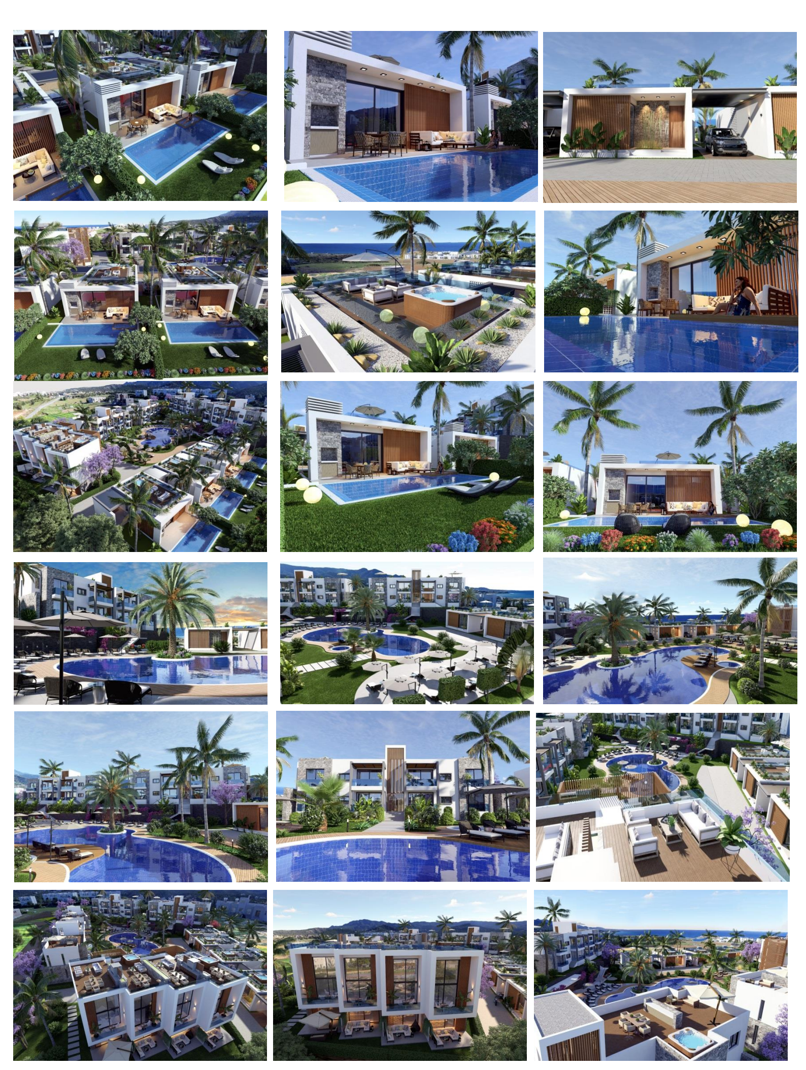
Page 2 of 5