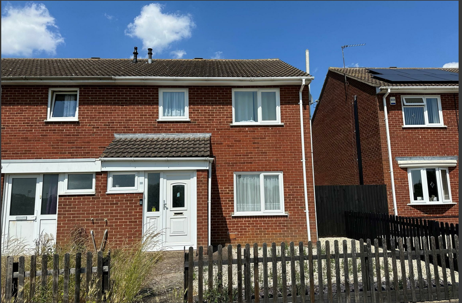
Olympic Way, Wellingborough NN8 3QE