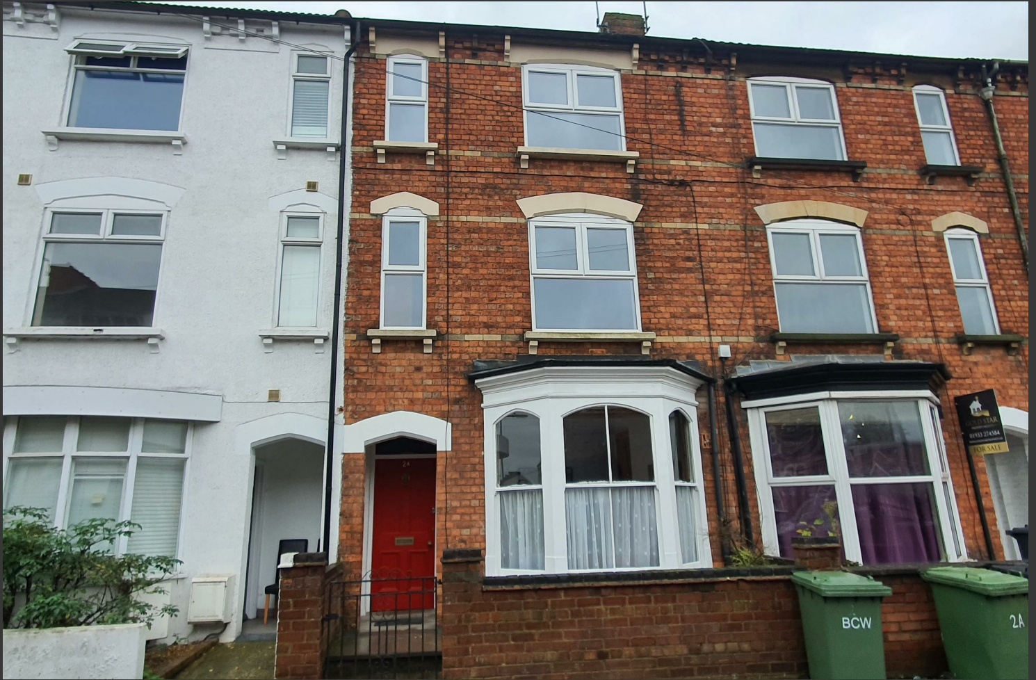
Knox Road, Wellingborough NN8 1HW £535 PCM