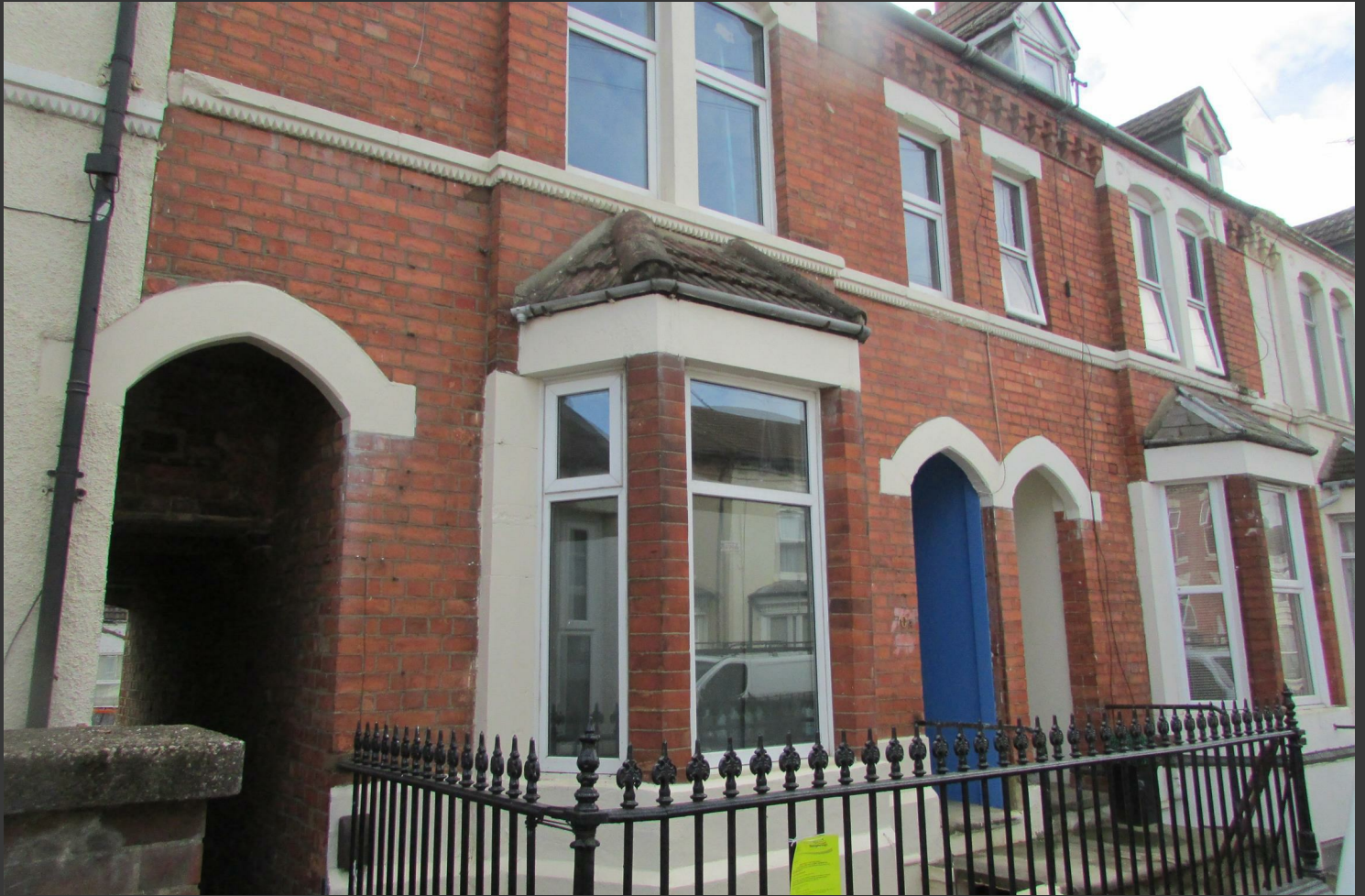
70a Knox Road, Wellingborough NN8 1JA £550 PCM

Smarta Move are pleased to offer for let this double bedroom which is situated on the second floor in this three story five bedroom spacious HMO which has been refurbished. The property is situated in the town centre of Wellingborough close to all local amenities including the train station which is within walking distance. The room comes fully furnished with all bills included and free WiFi. There is a fitted kitchen with built in appliances, to include washing machine and tumble dryer, two shower rooms. Available to view now and move in around 1st April 2025. There is a minimum stay of 6 months and deposit is £550 with EPC rating C.