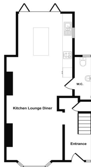
Ground Floor Approx 47 sq m / 505 sq ft

This floorplan is only for illustrative purposes and is not to scale. Measurements of rooms, doors, windows, and any items are approximate and no responsibility is taken for any error, omission or mis-statement. Icons of items such as bathroom suites are representations only and may not look like the real items. Made with Made Snappy 360.