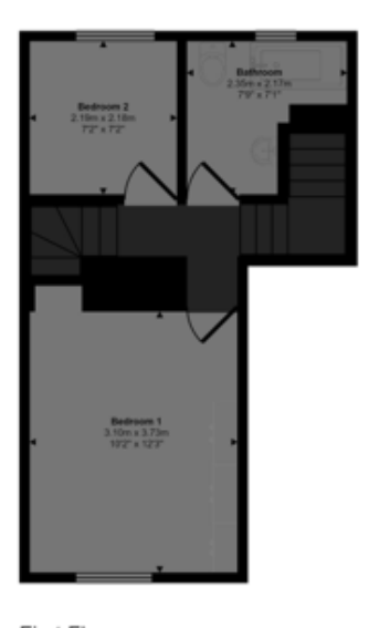
First Floor Approx 28 sq m / 304 sq ft