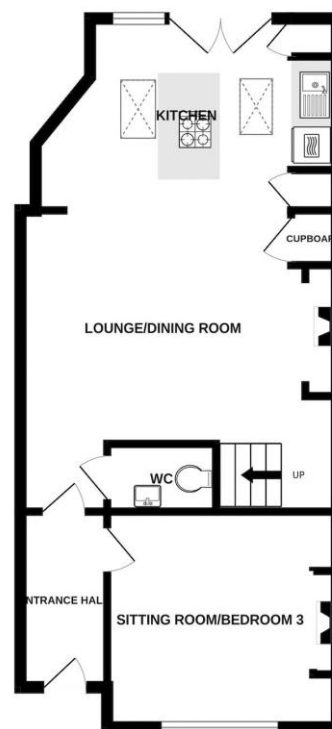
1ST FLOOR 34.6 sq.m. (372 sq.ft.) approx.