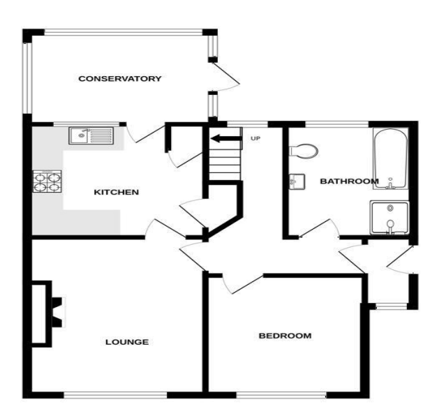
1ST FLOOR 29.6 sq.m. (318 sq.ft.) approx.