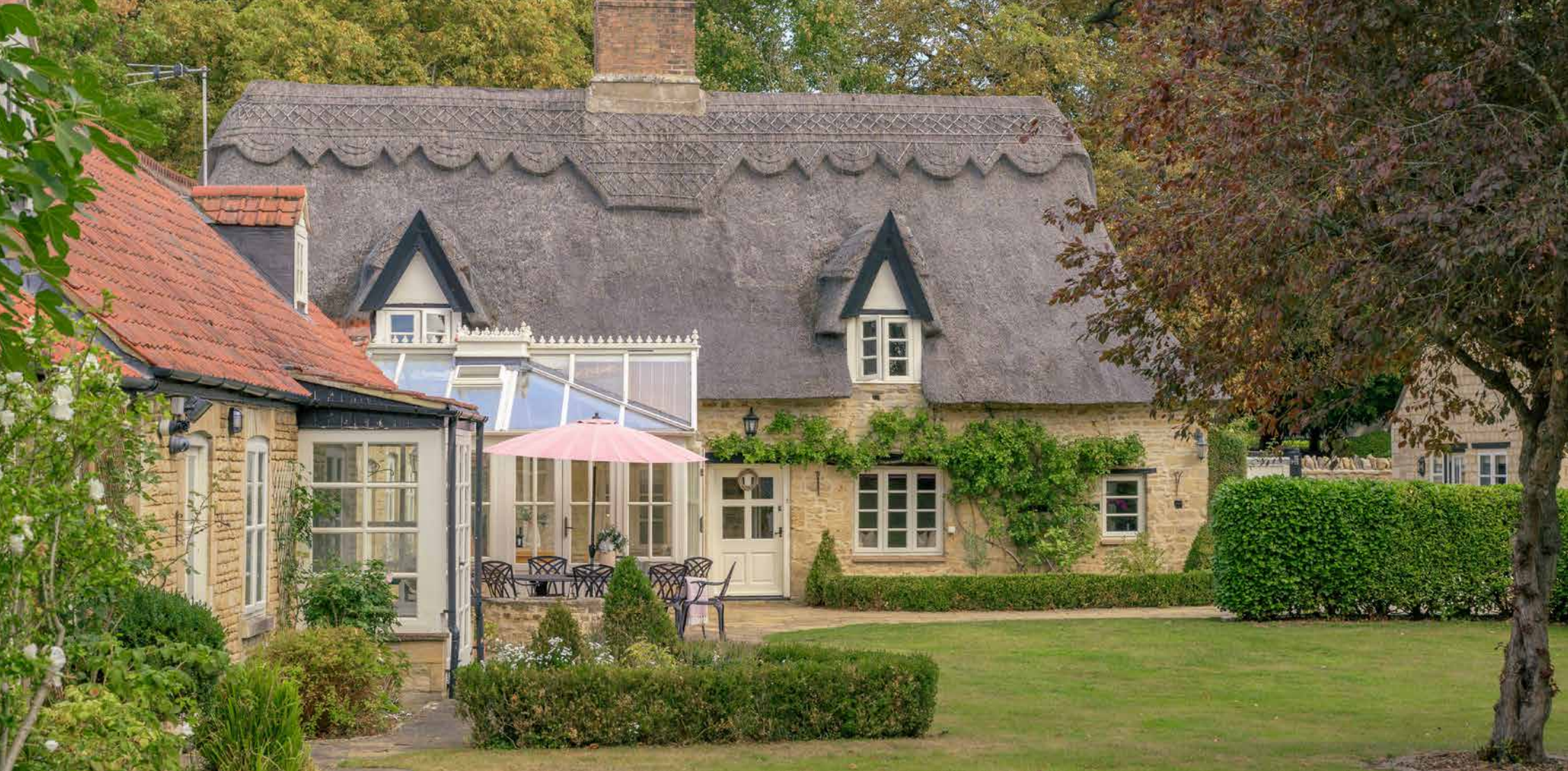
The Old Smithy, 47 Peterborough Road, Castor, Peterborough PE5 7AX