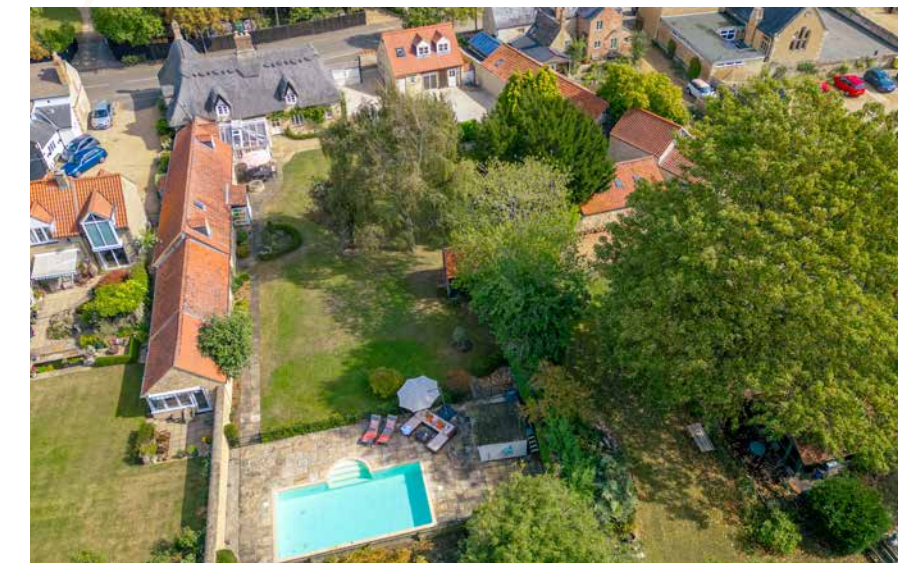
THE OLD SMITHY