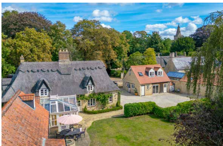
THE OLD SMITHY