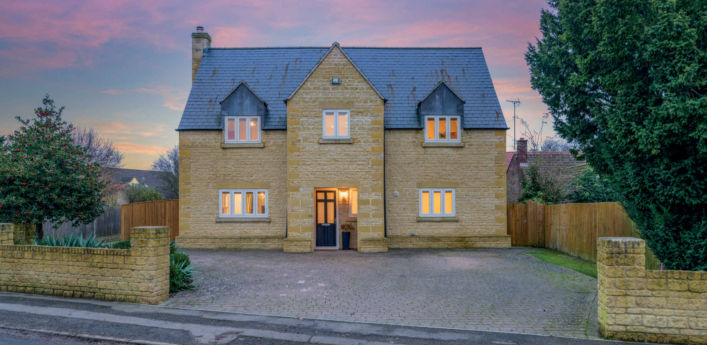
Clipsham House, 145 Eastgate, Deeping St James, Peterborough PE6 8RB