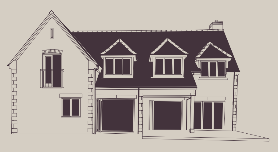
Mulberry House, 1a Nook Lane, Empingham, Rutland LE15 8PT