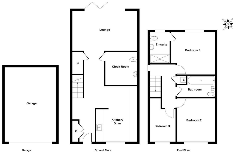
Illustration for identification purpose only, measurements approximate and not to scale, unauthorized reproduction is prohibited. All rights reserved for Alexander Hudson Estates