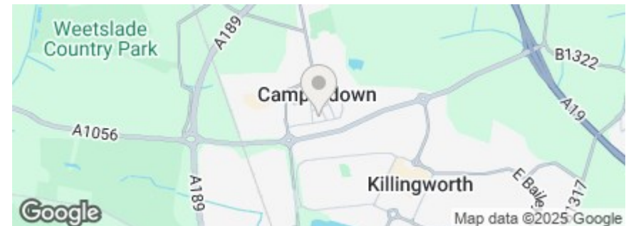
Illustration for identification purpose only, measurements approximate and not to scale, unauthorized reproduction is prohibited. All rights reserved for Alexander Hudson Estates

Approx. Gross Internal Floor Area 767 sq. ft / 71.25 sq. m