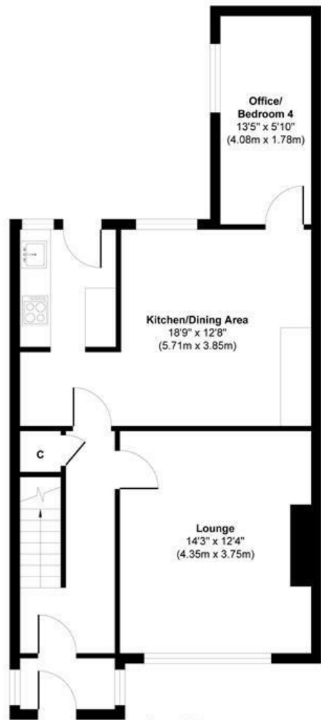
Ground Floor Approximate Floor Area 612 sq. ft (56.87 sq. m)