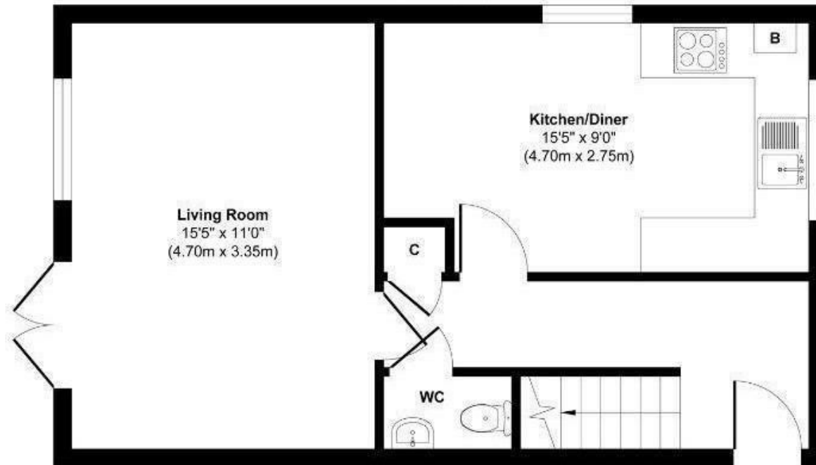
Ground Floor Approximate Floor Area 412 sq. ft (38.30 sq. m)