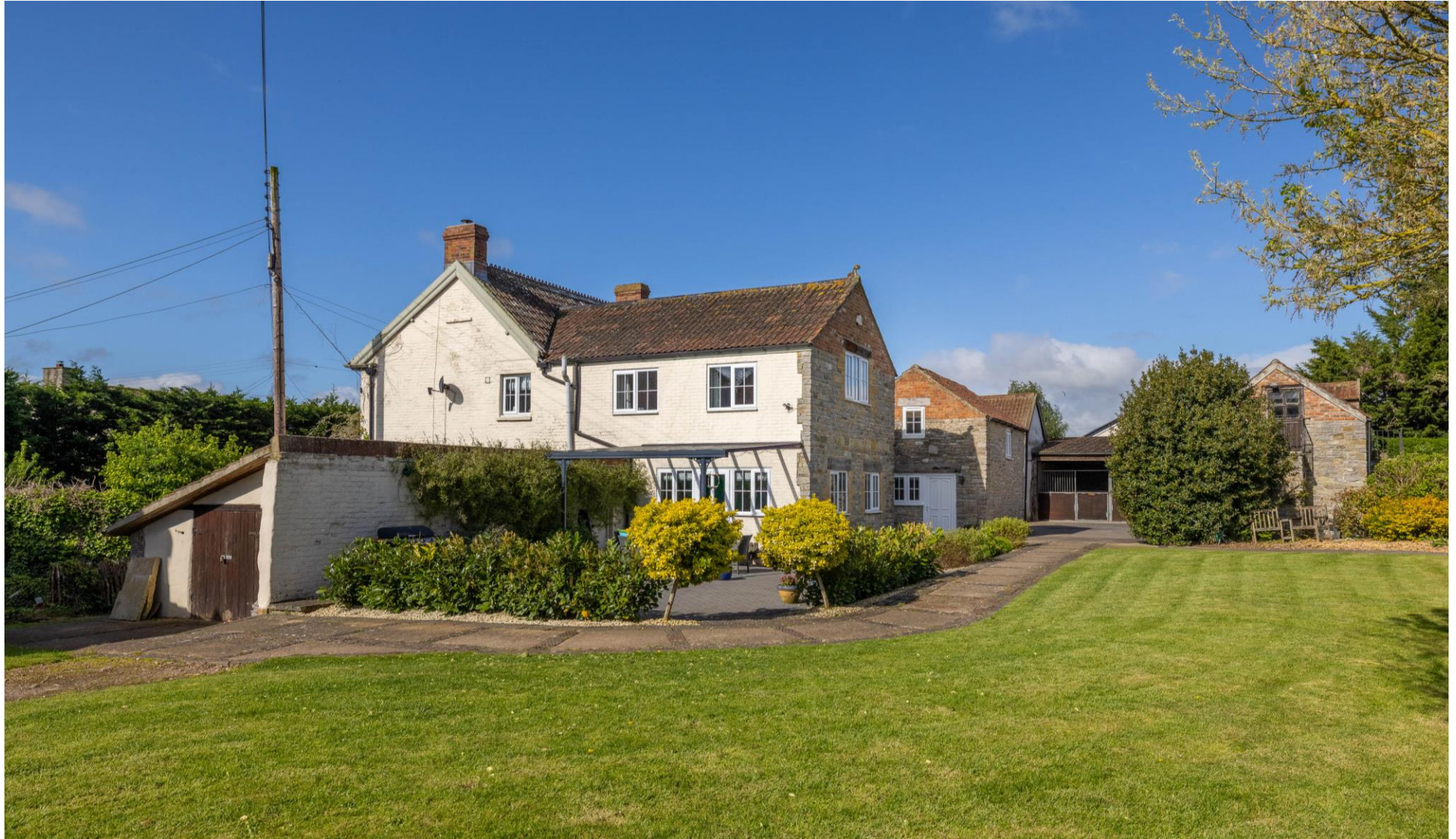
Little England House, Othery