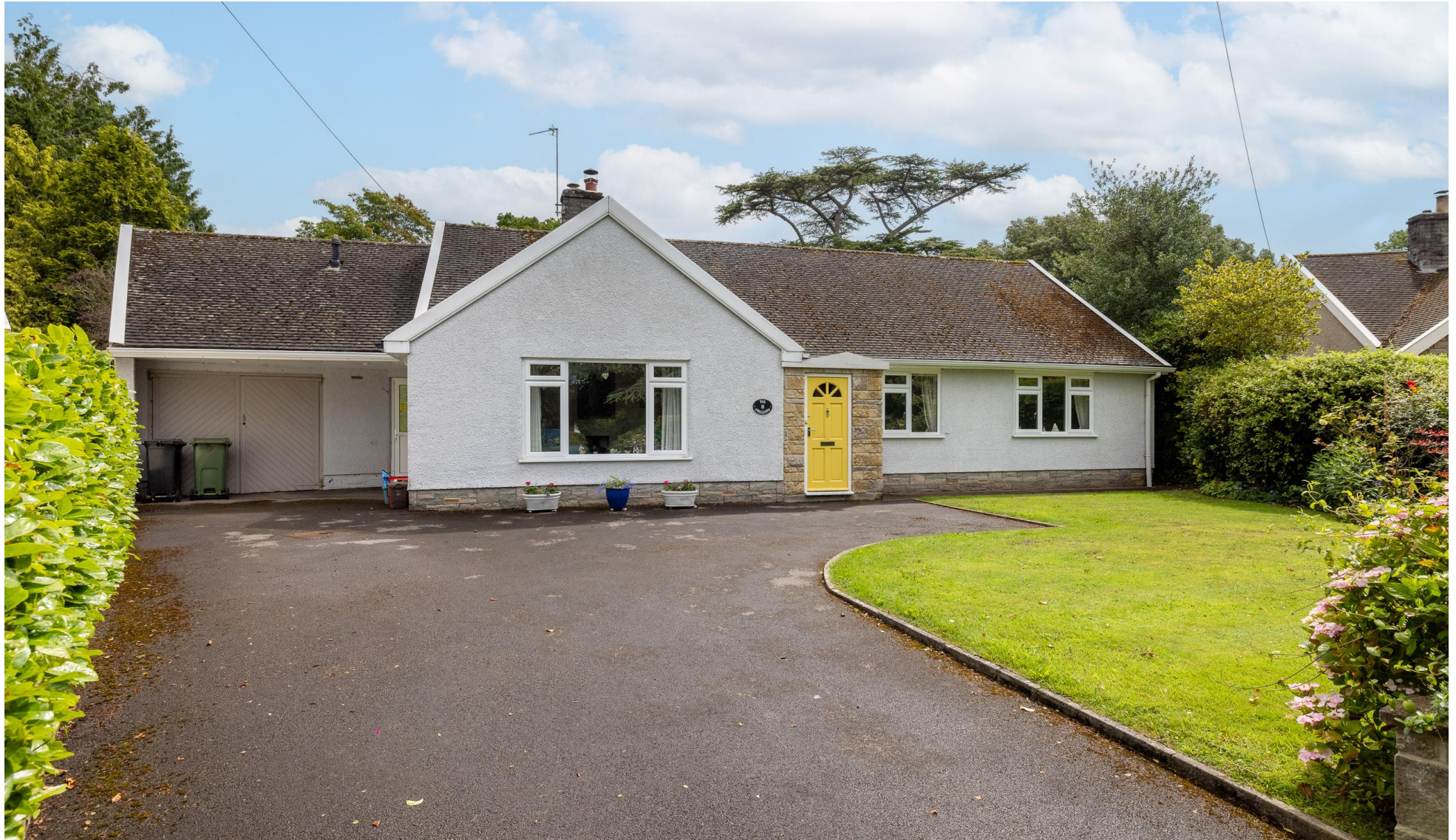
The Swallows - 8 Abbey Close, Wookey