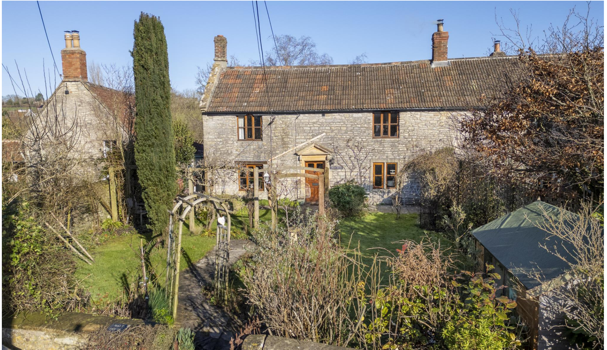
Malta House, Pitton