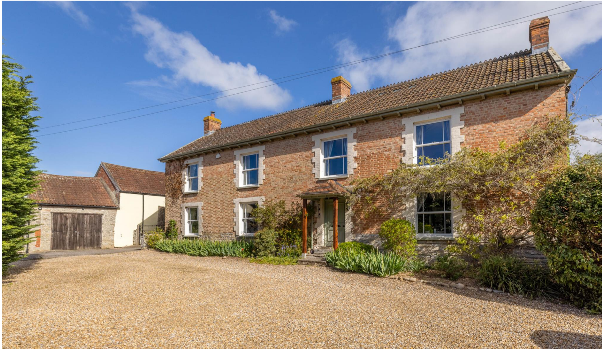
Little England House, Othery