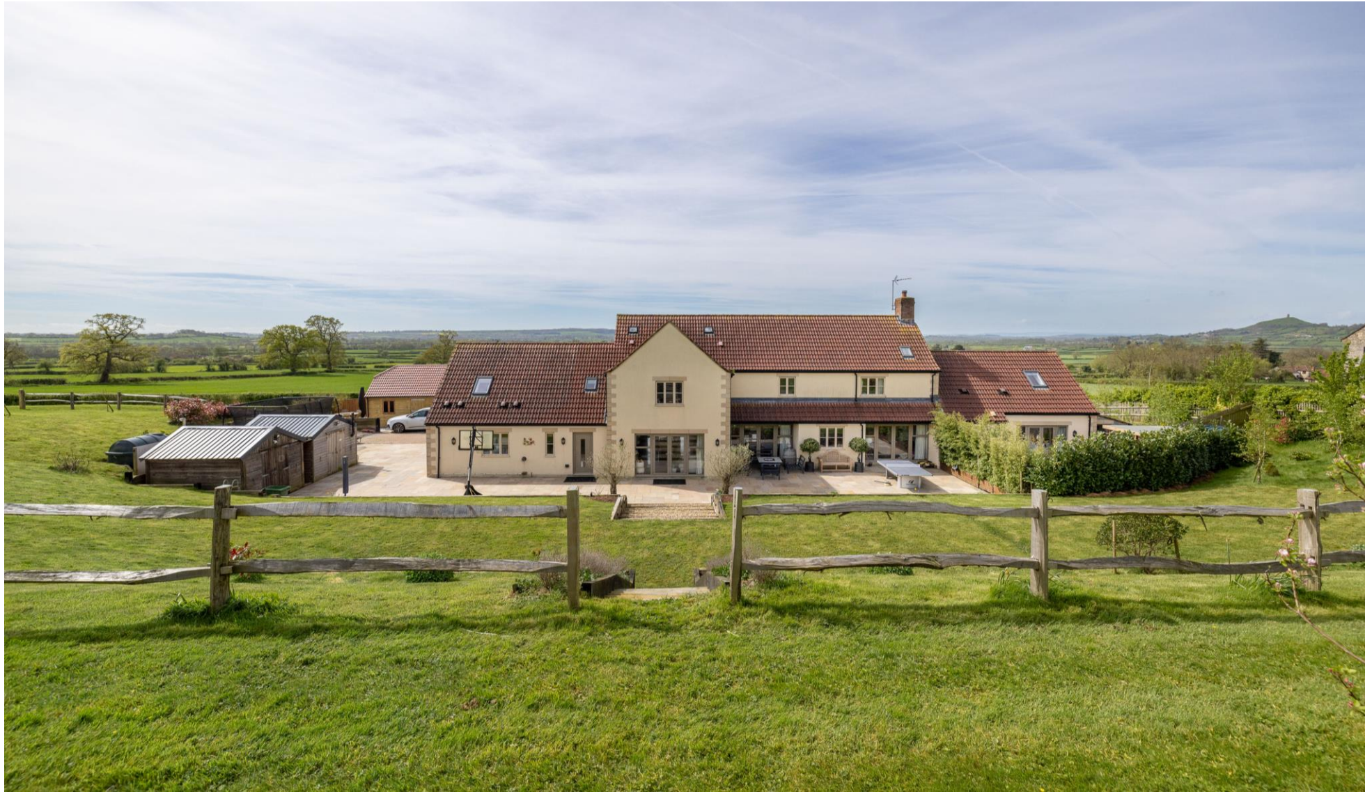
Old Orchard House, West Pennard