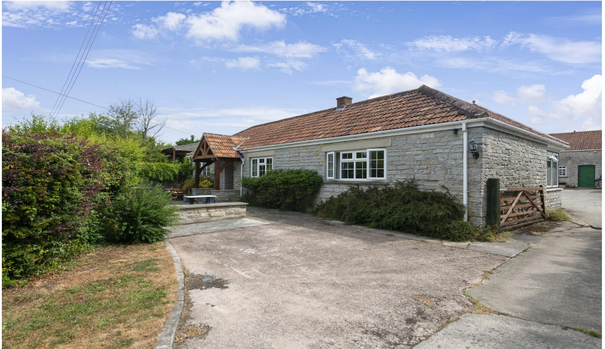
Westwood Cottage, West Lydford