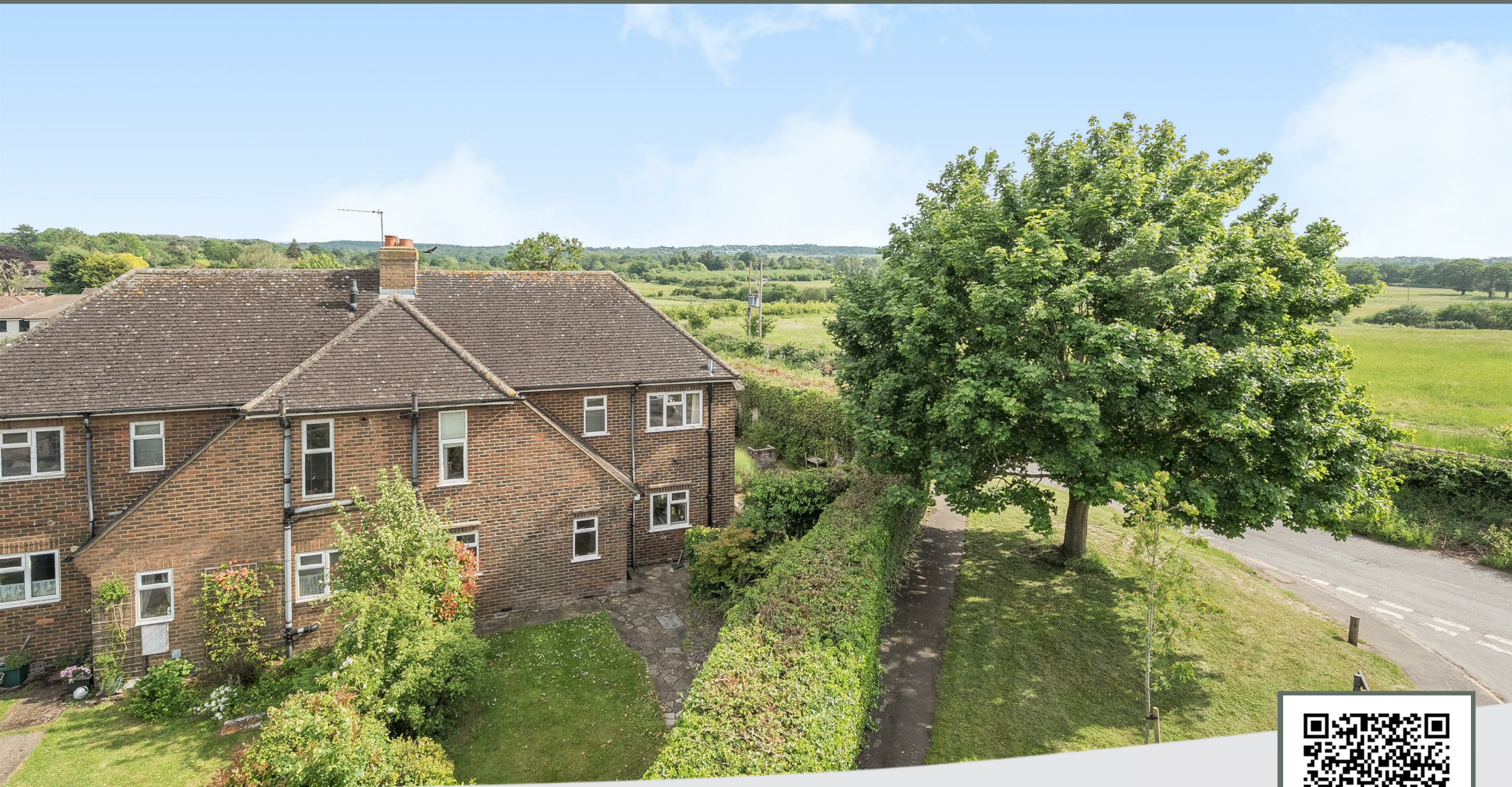
2 Farleys Close West Horsley, Surrey KT24 6NB