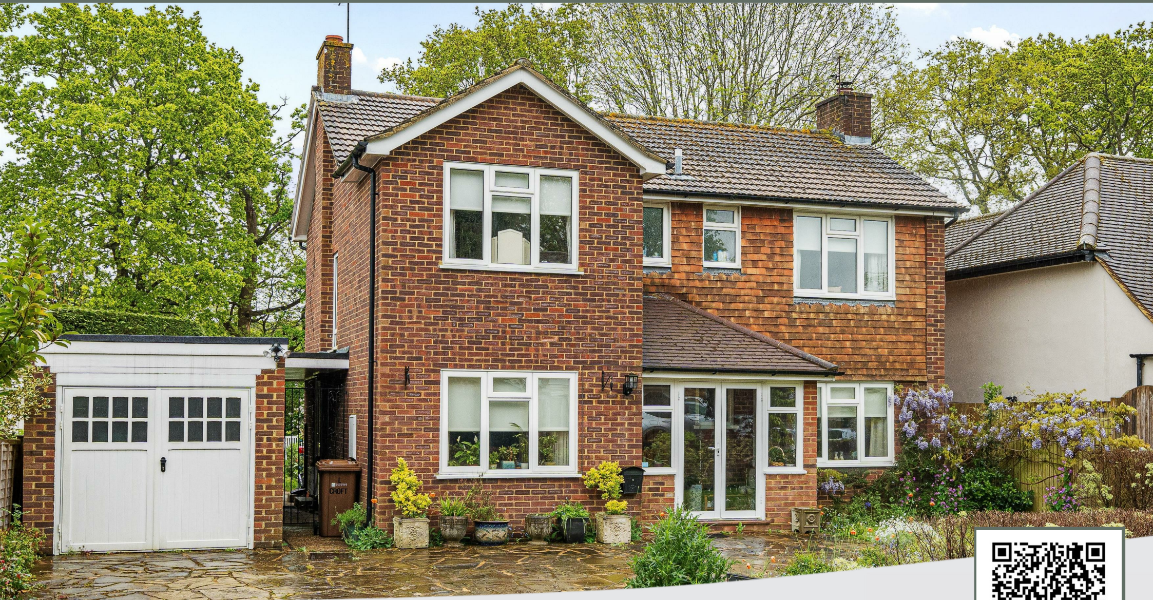
Linden Croft Heatherdene West Horsley, Surrey KT24 6LH