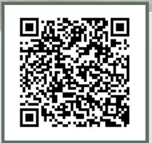
Flat 10 Lutidine House, Newark Lane Ripley, Surrey GU23 6BS