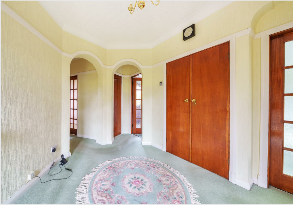
A delightful 3 bedroom detached character bungalow in the very heart of Horsley village, occupying a bold corner plot less than 200 yards from the shops, with scope to enlarge or enjoy just as it is. Enclosed Entrance Porch - Large Reception Hall - Sitting Room with Bay Window & Feature Fireplace - Kitchen - Dining Room - 2 Double Bedrooms - Bedroom 3/Study - 2 Bath/Shower Rooms - Gated In & Out Drive - Detached Double Garage - Delightful 0.29 Acre Gardens - No onward chain