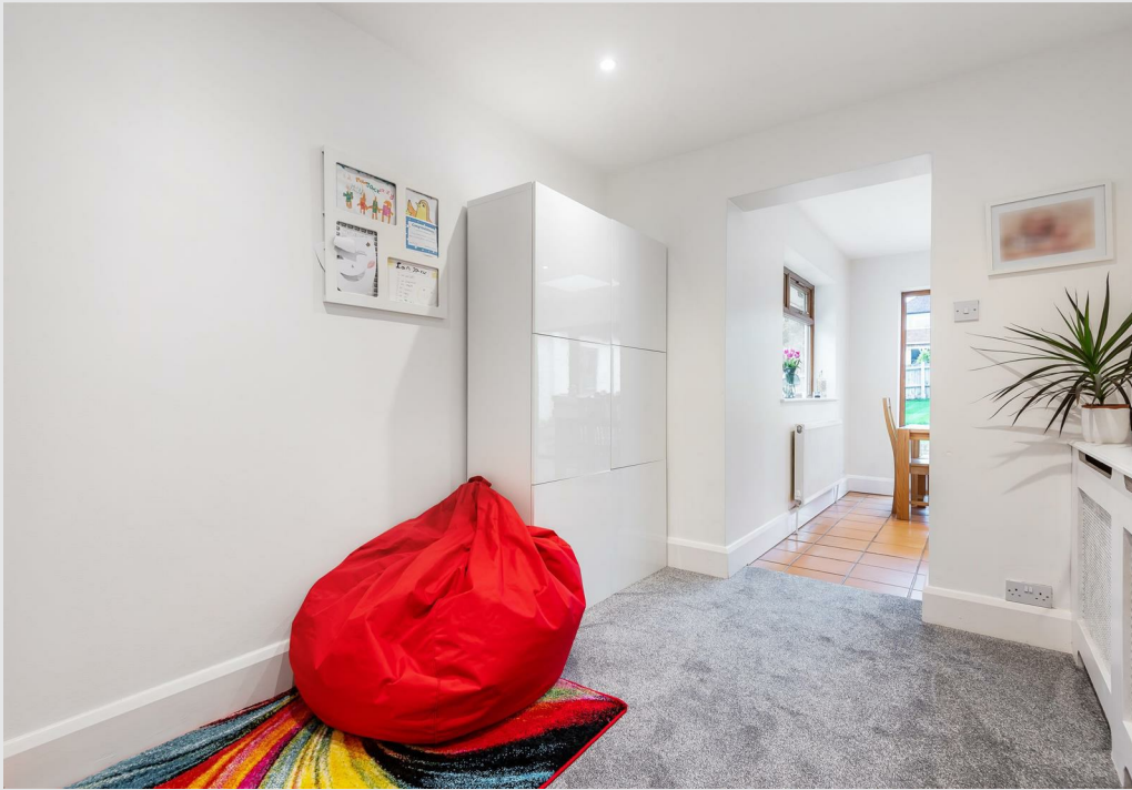
A charming detached bungalow in this prestigious Private Road location just a 100 yard stroll from the main shops, cafes, restaurants and Station of East Horsley village.