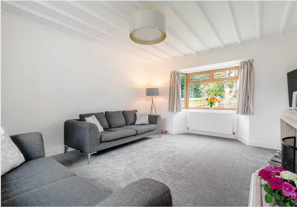
A charming detached bungalow in this prestigious Private Road location just a 100 yard stroll from the main shops, cafes, restaurants and Station of East Horsley village.