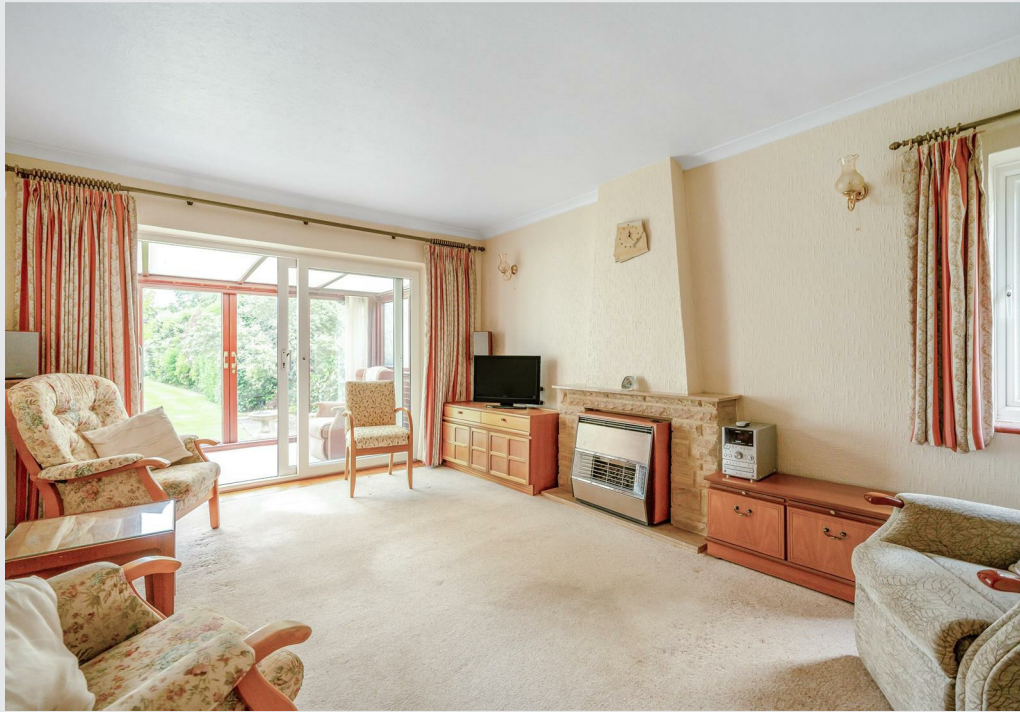
A detached chalet style bungalow in beautiful gardens, with fabulous potential situated in this highly regarded location just a 0.3 mile stroll to the Station (Waterloo 40 mins) and Effingham Common.