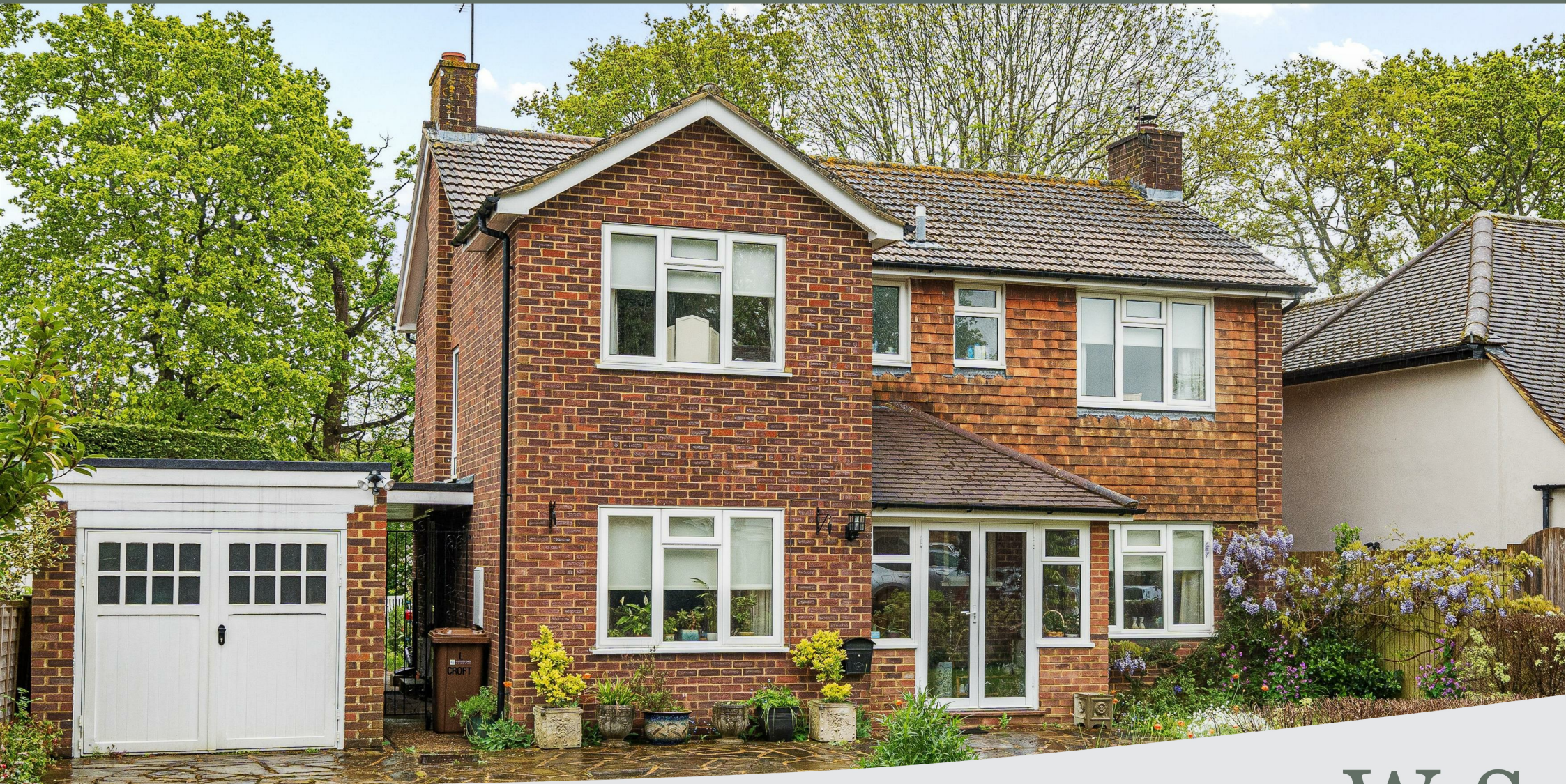
Linden Croft Heatherdene West Horsley, Surrey KT24 6LH