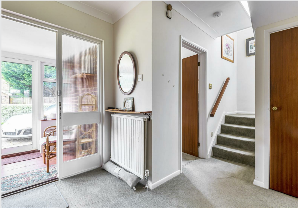
A delightful 4 bedroom detached family home in Private Road location, just 2/3rds mile walk from Horsley village with its shops and station, and offering the incoming owner lots of scope to enlarge subject to their own requirements (STPP). Porch - Hallway - Dining/Sitting Room - Kitchen - Study - 4 Bedrooms (Main with shower facilities) - Double Length Garage - Delightful Gardens