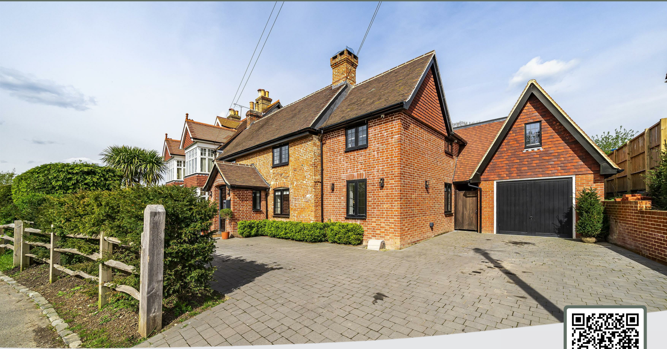
Honeysuckle Cottage, Cranmore Lane West Horsley, Surrey KT24 6BU