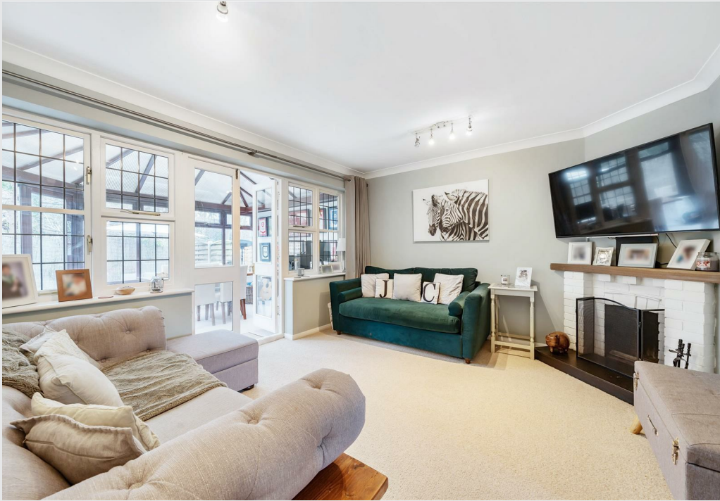
An exceptionally well presented three bedroom semi detached property with private garden in the heart of East Horsley, ideal for downsizers, a young family or as an investment.